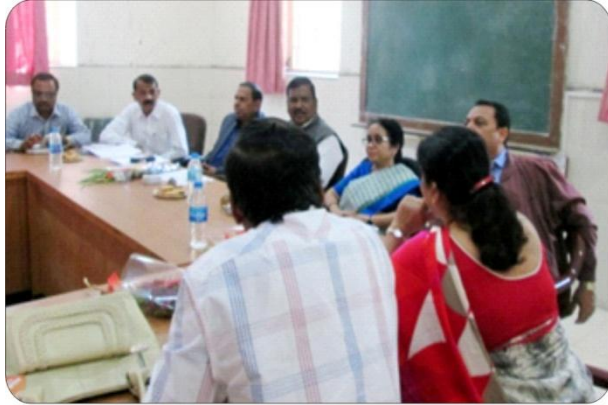
Meeting with MSCERT

The team members interacted with the Director, Joint Director, Associate Professor and Lecturers of MSCERT. Maharashtra State Council of Educational Research & Training is the apex institute of the state to provide academic support to the School Education. It was declared as a State Academic Authority on 07.03.2012. MSCERT, Pune is the 'Apex Institute' in teacher training and the nodal agency of NCTE.