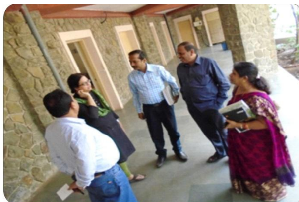
The team sharing with the faculty of TISS