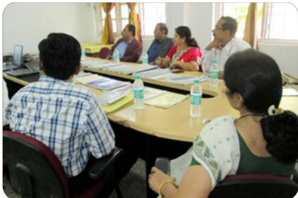
Meeting at SNDT, IASE