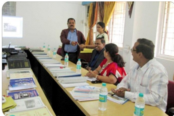
Seminar Room of SNDT, IASE