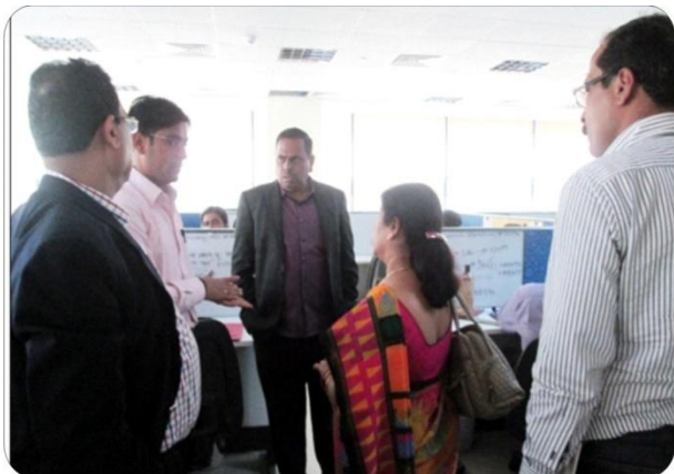
Meeting with MKCL at Mumbai