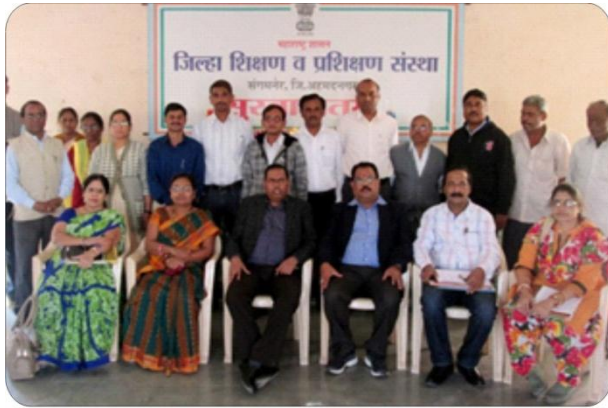
Team with DIET Sangamner Faculty