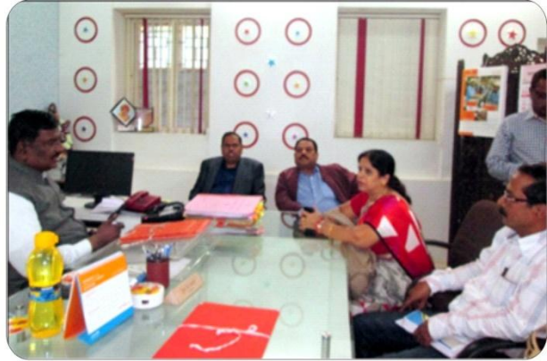
Meeting with Director MSCERT

State level Institutions working under umbrella of MSCERT :