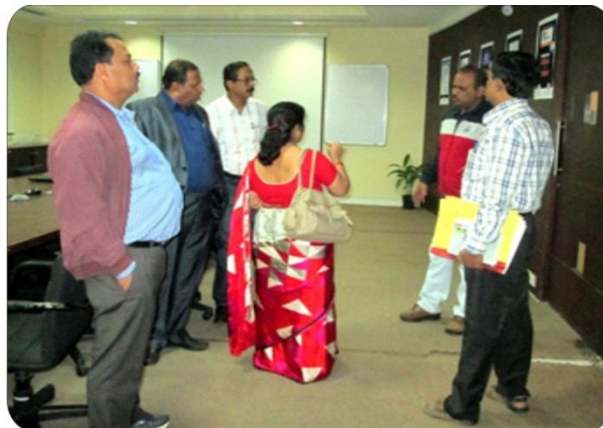
At MKCL, Pune

MKCL has the joint ventures at Rajasthan (RKCL), Odisha (OKCL) and Haryana (HKCL) in India and has created the joint venture at Sharjah, UAE, Egypt, Malaysia, Sri Lanka and Ghana in abroad.