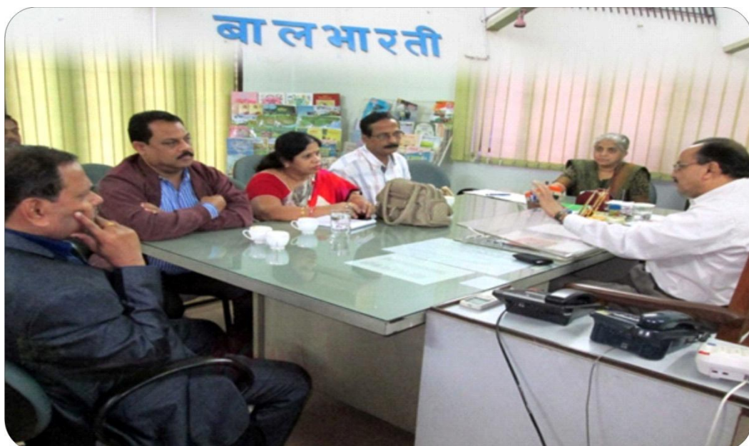
Meeting with the Direcotr, TBPM (Bal Bharati)