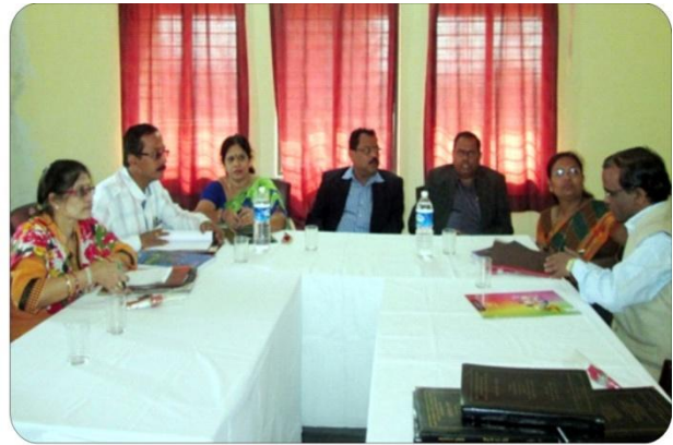
Team during the presentation at DIET