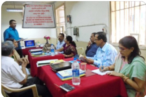
The discussion of SIVGS faculty with the team