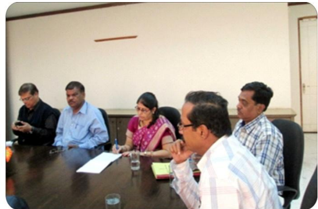
Meeting with the Officers of State Education Board, Pune