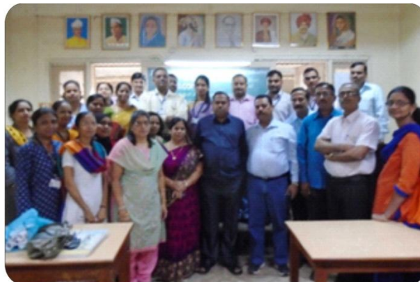
The team with the faculty of SIVGS, Mumbai

Director, MSCERT is the controlling authority of SIVGS. The section is headed by one Deputy Director. In order to assist the Deputy Director, there are 03 Vocational Guidance officers, 05 Assistant Vocational Guidance Officers and 03 counsellors functioning in the Mumbai SIVGS.